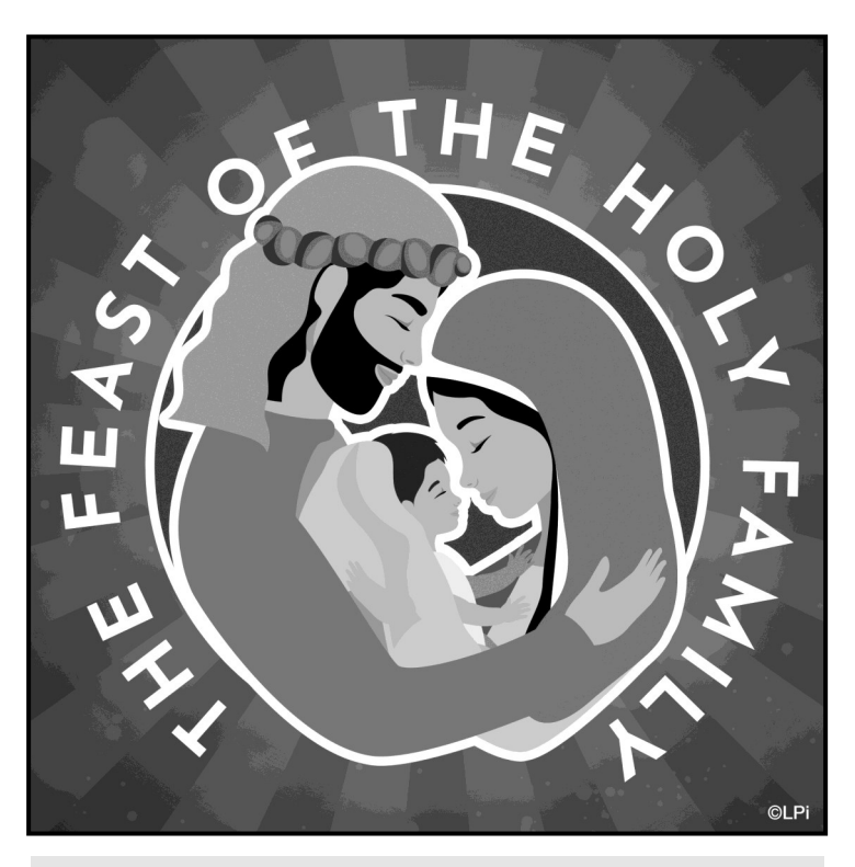
The Holy Family