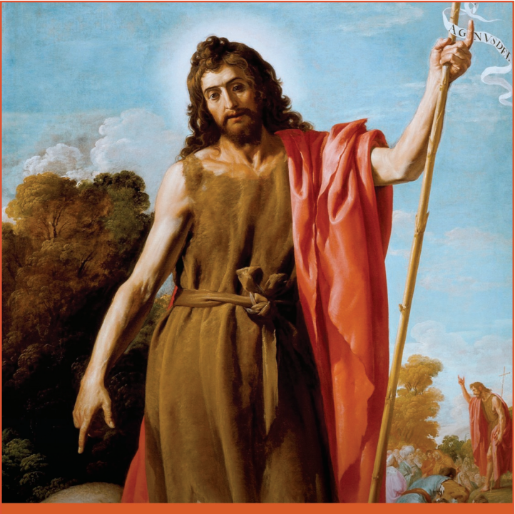
2<sup>ND</sup> SUNDAY OF ADVENT

1005 West Main Street Danville, Indiana 46122 Phone: 317-745-4284 Web Site: www.mqpdanville.org