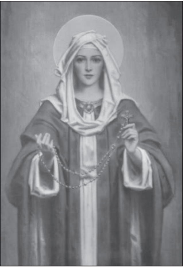
October The Month of the Rosary