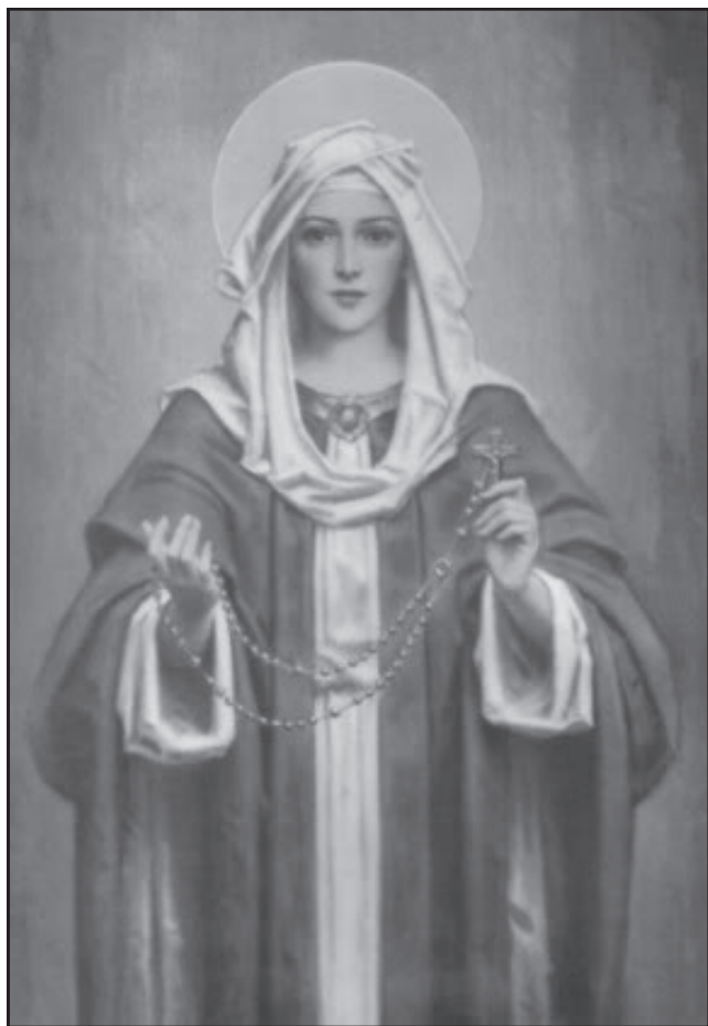
October The Month of the Rosary

PLEASE RETURN BY OCT. 25TH!! THESE WILL BE PLACED IN OUR "BOOK OF REMEMBRANCE".